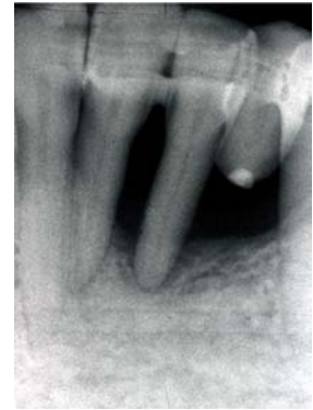
20 months post-op

The complete clinical case was published in the German 'Paradontologie' Journal in 2004